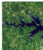
Map of Dave Slaughter's secret spots!!!!